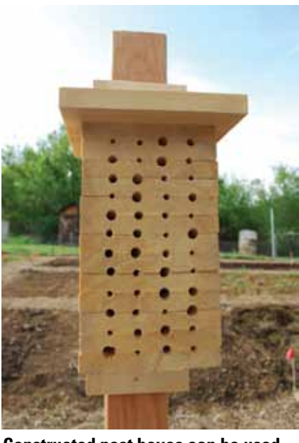
Constructed nest boxes can be used for wood nesters like the blue orchard bee.