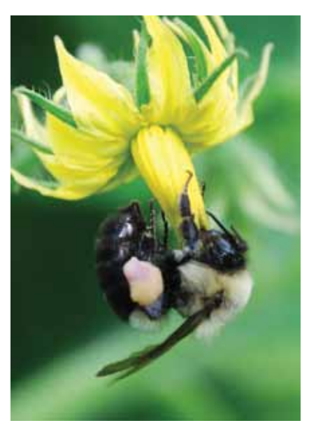
Bumble bee on a tomato flower at Penn State's community garden.

We can conserve and attract wild bee species to Pennsylvania by increasing the amount of floral resources in the area, conserving natural habitats in the land-scape, providing access to clean water, creating or conserving nesting sites, and reducing bee exposure to pesticides.