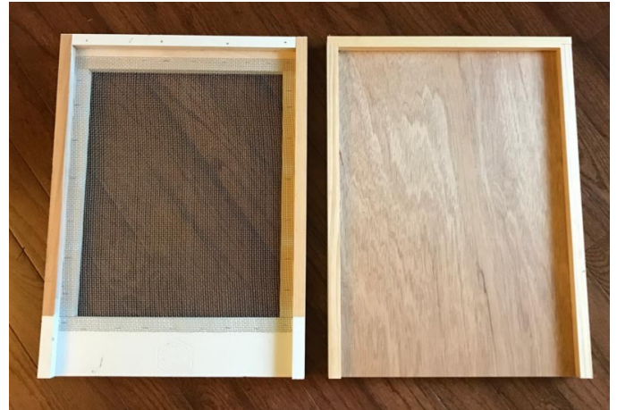
Figure 5. The bottom board on the left is a screened bottom board, whereas the one on the right is a solid bottom board. The floor of the hive can be screened to allow varroa mites to fall through to the ground, where they cannot return to the colony.

Mites naturally fall off of bees as a result of movement within the colony and honey bee grooming behavior. If a screened bottom board, rather than solid wood one is used (Figure 5), mites fall onto the ground and are less likely to climb back onto the bees. Screened bottom boards decrease mite invasion into brood cells, resulting in a lower percentage of the population being found in the brood reproducing. Mite loads often still reach economic thresholds in hives with screened bottom boards, so this physical method to control varroa mites must be used in combination with other control techniques.