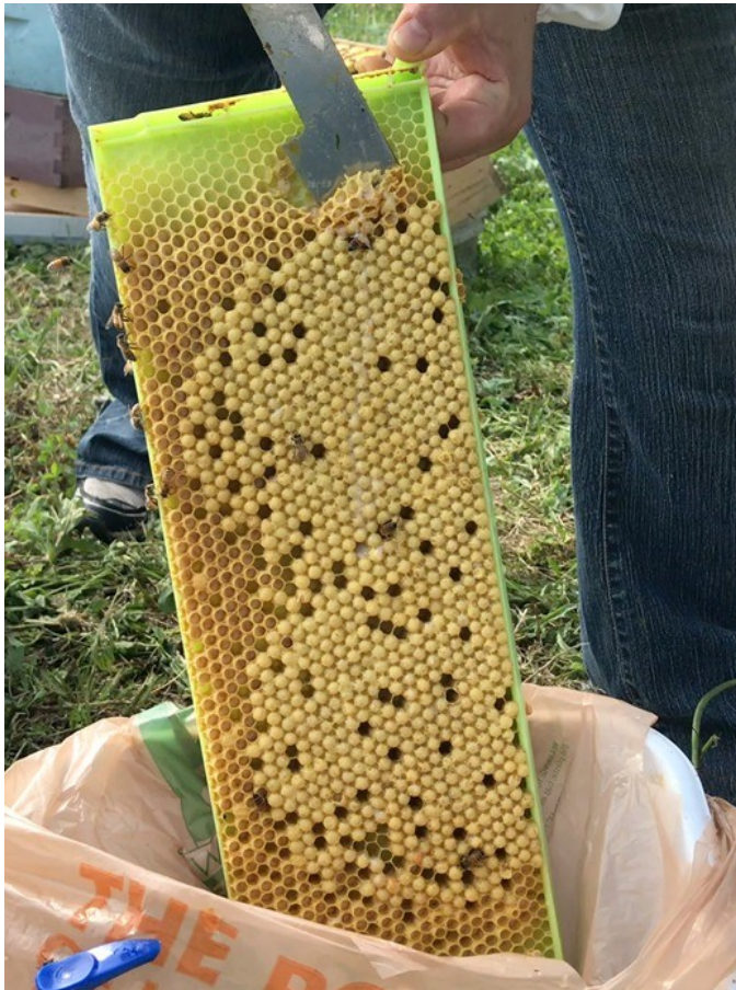
Figure 4. Scraping drone brood from a frame that was added to act as a mite trap.

Drone brood removal takes advantage of the mites' preference for drone brood for reproduction, using them as a trap. Varroa mites have higher reproductive success in drone brood than in worker brood due to the post-capping period allowing mites to produce only 1.3-1.4 offspring per attempt in worker cells, but 2.2-2.6 offspring in drone cells (Figure 2). In addition, the period of attractiveness of drone brood is 40-50 hours, as opposed to only 15-30 hours in worker brood. Together, these reproductive advantages of drone brood manifest as a 6-fold increase in mites found under the cappings of drone cells than under worker cells. Adding drone comb to a colony encourages drone production that acts as a trap for mites. Removing that comb prior to drone emergence effectively removes the varroa mites reproducing in the cells. The drone brood can then be frozen and returned to the colony or scraped off of the frame (Figure 4). This practice reduces mite reproduction, which prolongs the length of time before the population reaches the threshold. However, it may not be effective enough to act as the only means for controlling varroa mites.