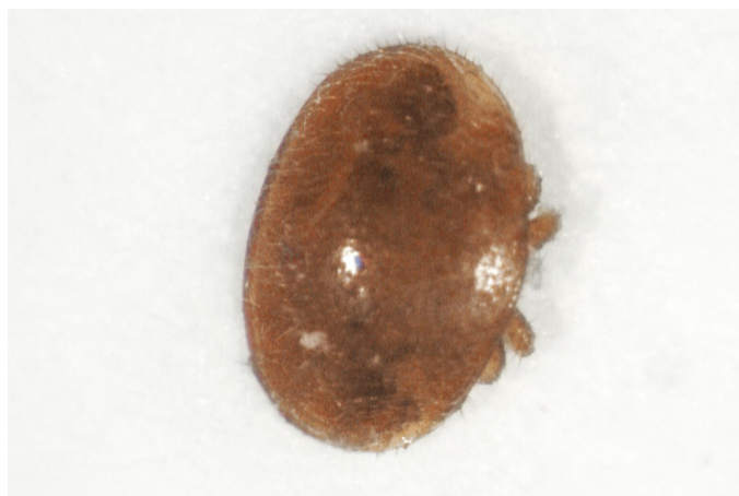
Figure 1. The varroa mite, Varroa destructor .

Varroa mites ( Varroa destructor ), are the most influential of all of the pests and diseases of the European honey bee ( Apis mellifera ) today.